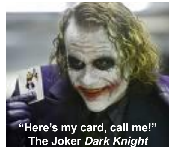
"Here's my card, call me!" The Joker Dark Knight